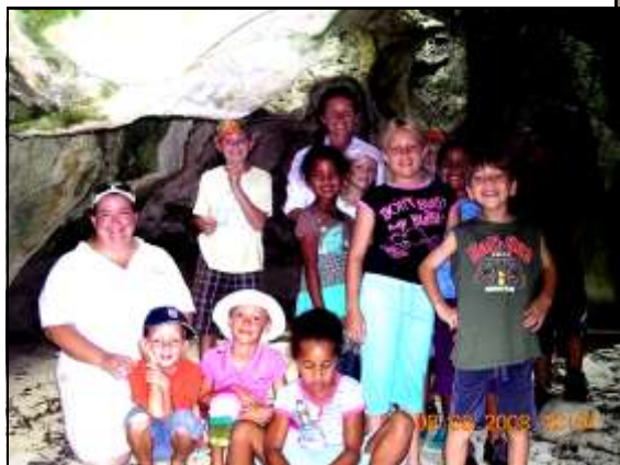
Summer Camp 2008 at a Bat Cave