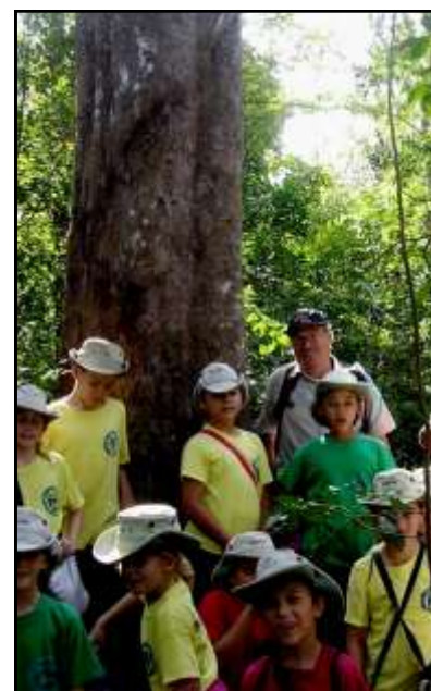
Mastic Trail Tour