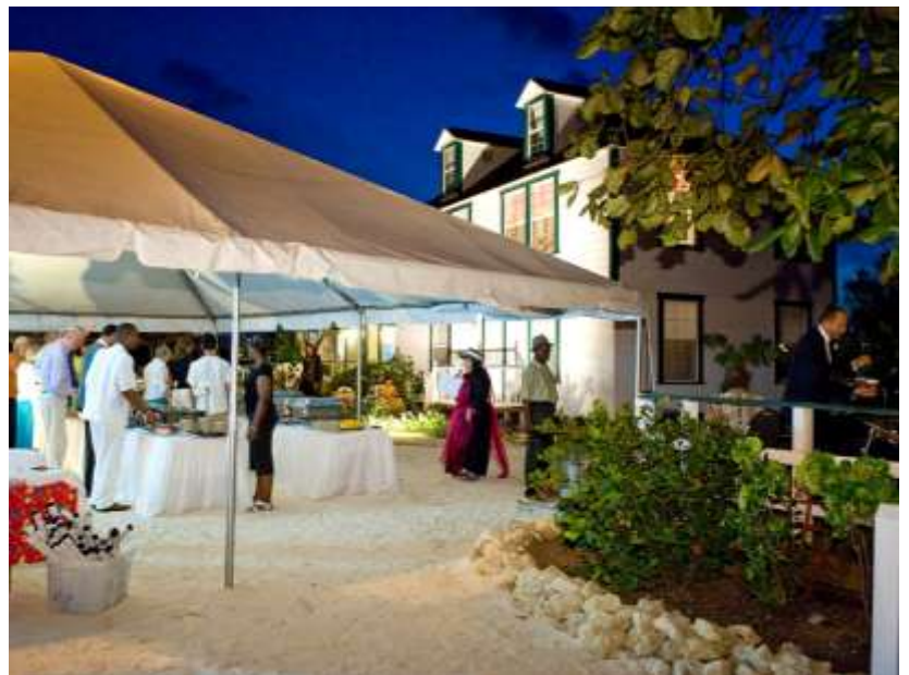
United Kingdom Overseas Territories Conservation Forum Dinner hosted at the Mission House

Bronze Altajir Bank Bank of Butterfield British Caymanian Insurance Cayman National Corporation Ltd Conyers Dill & Pearman Queensgate Bank & Trust Company Ltd Shaw Holdings Ltd Water Authority Cayman