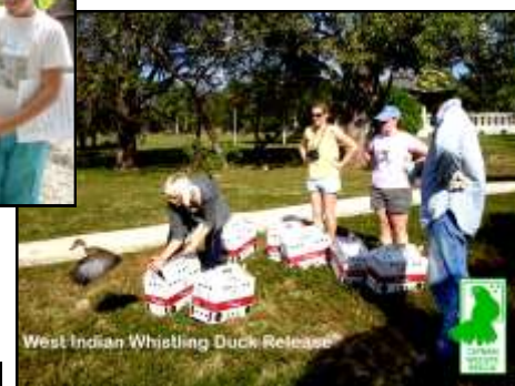
Whistling Duck Release