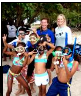
Snorkeling at summer camp!