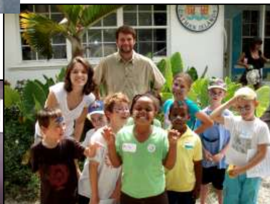
Summer Camp 2008 Blue Iguana Faces!