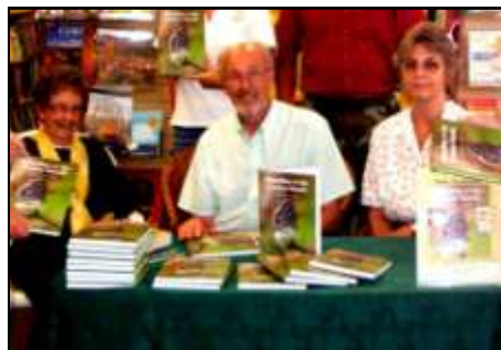
Butterflies Book Launch