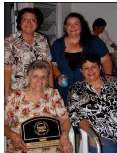
Historic Preservation Awards