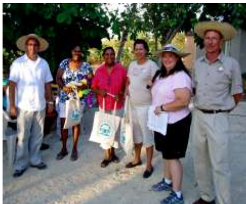
3rd Annual Tea Party in BT