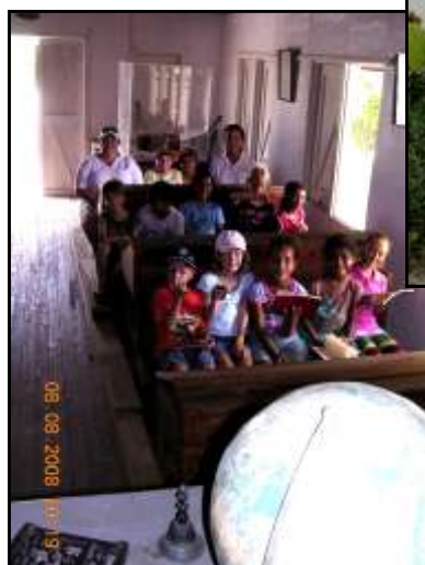
Summer Camp 2008 at Savannah Schoolhouse