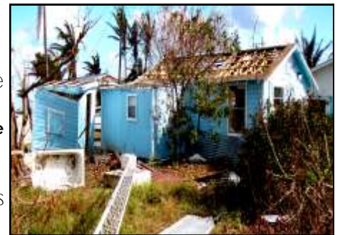
Brac Trust House

"SOME OF THE BEST SURVIVORS OF [ HURRICANE PALOMA] WERE HOUSES BUILT SOON AFTER THE '32 STORM."