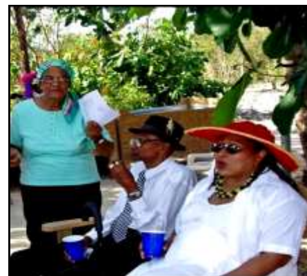
3rd Annual Tea Party in BT